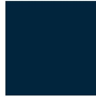
Polyethylene Mat blue navy