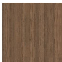
Solid wood Walnut Canaletto

Materials, fabrics, leathers, colors and finishes are approximate and may slightly differ from actual ones. You can find the complete collection of Bonaldo fabrics and leathers on the website