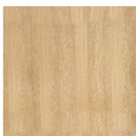
Solid wood Natural ash