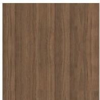
Veneered wood Walnut Canaletto