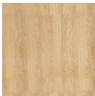
Veneered wood Natural ash

Materials, fabrics, leathers, colors and finishes are approximate and may slightly differ from actual ones. You can find the complete collection of Bonaldo fabrics and leathers on the website