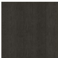
Veneered wood Coal ash