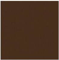
Painted metal Mat bronze