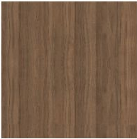
Veneered wood Walnut Canaletto