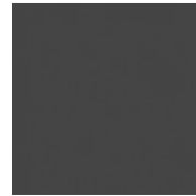
Painted metal Supreme anthracite