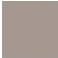
Painted metal Mat dove grey