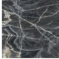
Glossy ceramic Black Onyx