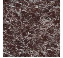
Glossy ceramic Rosso imperiale