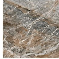
Glossy ceramic Mountain peak