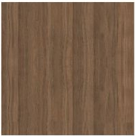
Veneered wood Walnut Canaletto