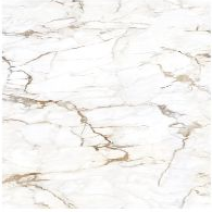
Silk finish ceramic Calacatta macchia vecchia