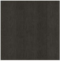
Solid wood Coal ash