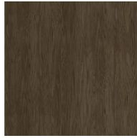
Solid wood Walnut painted ash