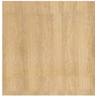
Solid wood Natural ash