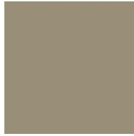
Painted metal Mat pearl gold