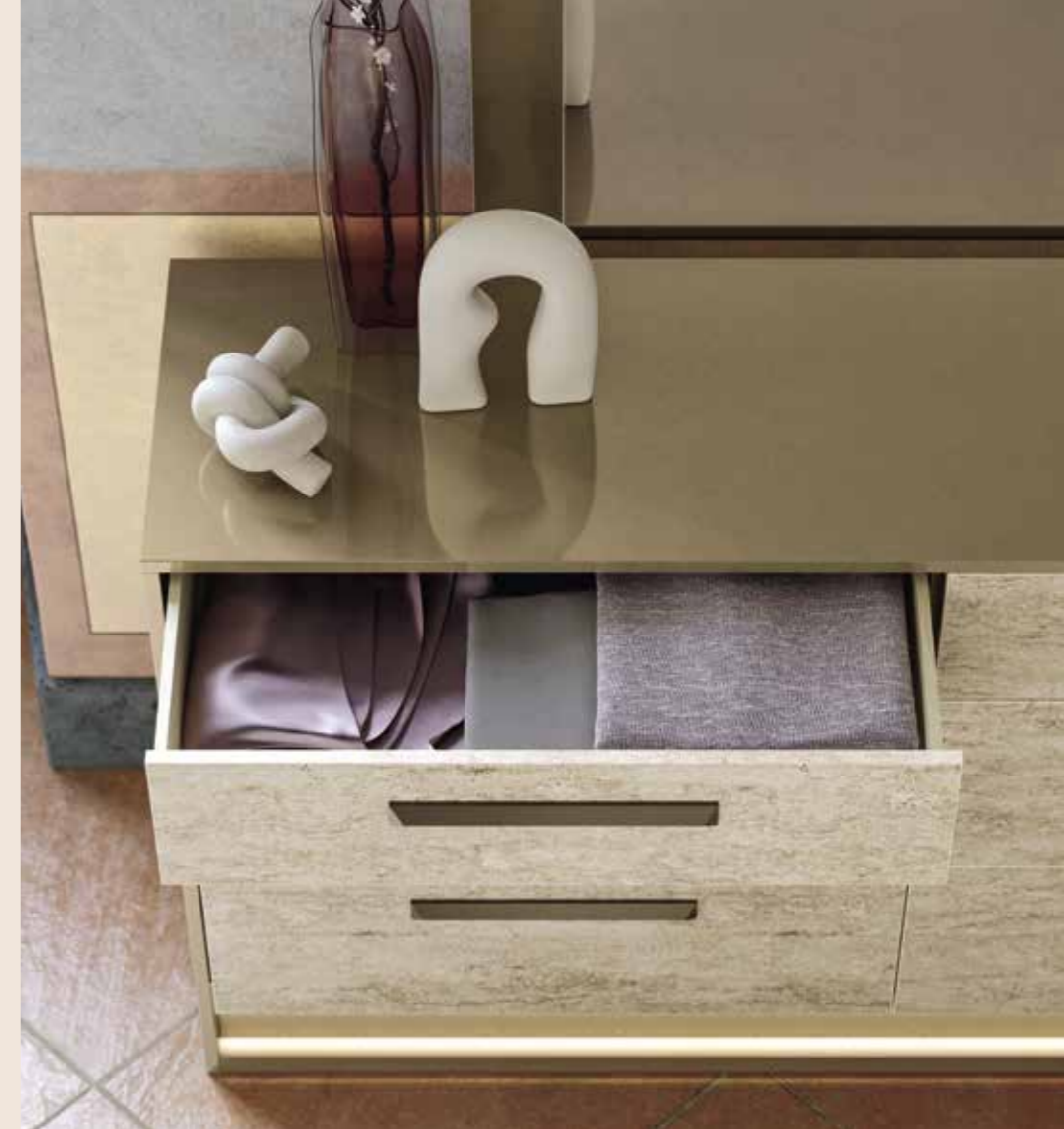
Jo bedroom set, roman interior