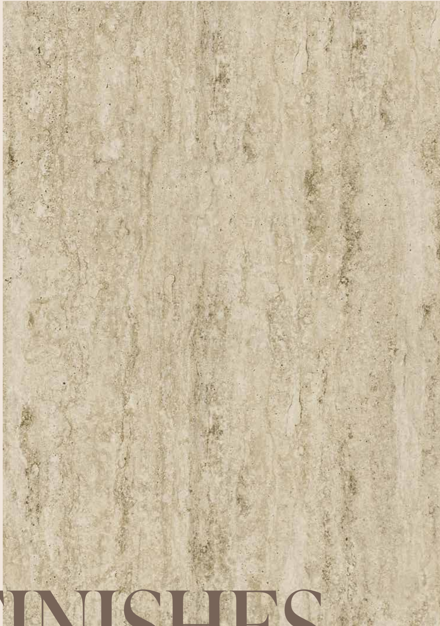
TRAVERTINO ECO STONE