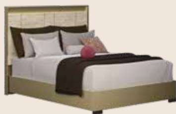
Q.S./UK 5" BED PJJ00150