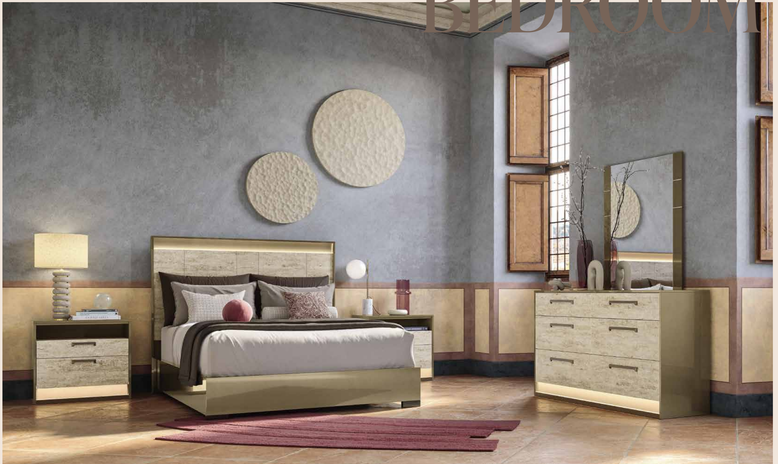
Jo bedroom set, roman interior