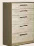
5/DRW. CHEST KJJO117

inch W 28" D 18" H 26" cm L 71,2 P 45 H 67 Crts 1 kg 36 m 3 0,29