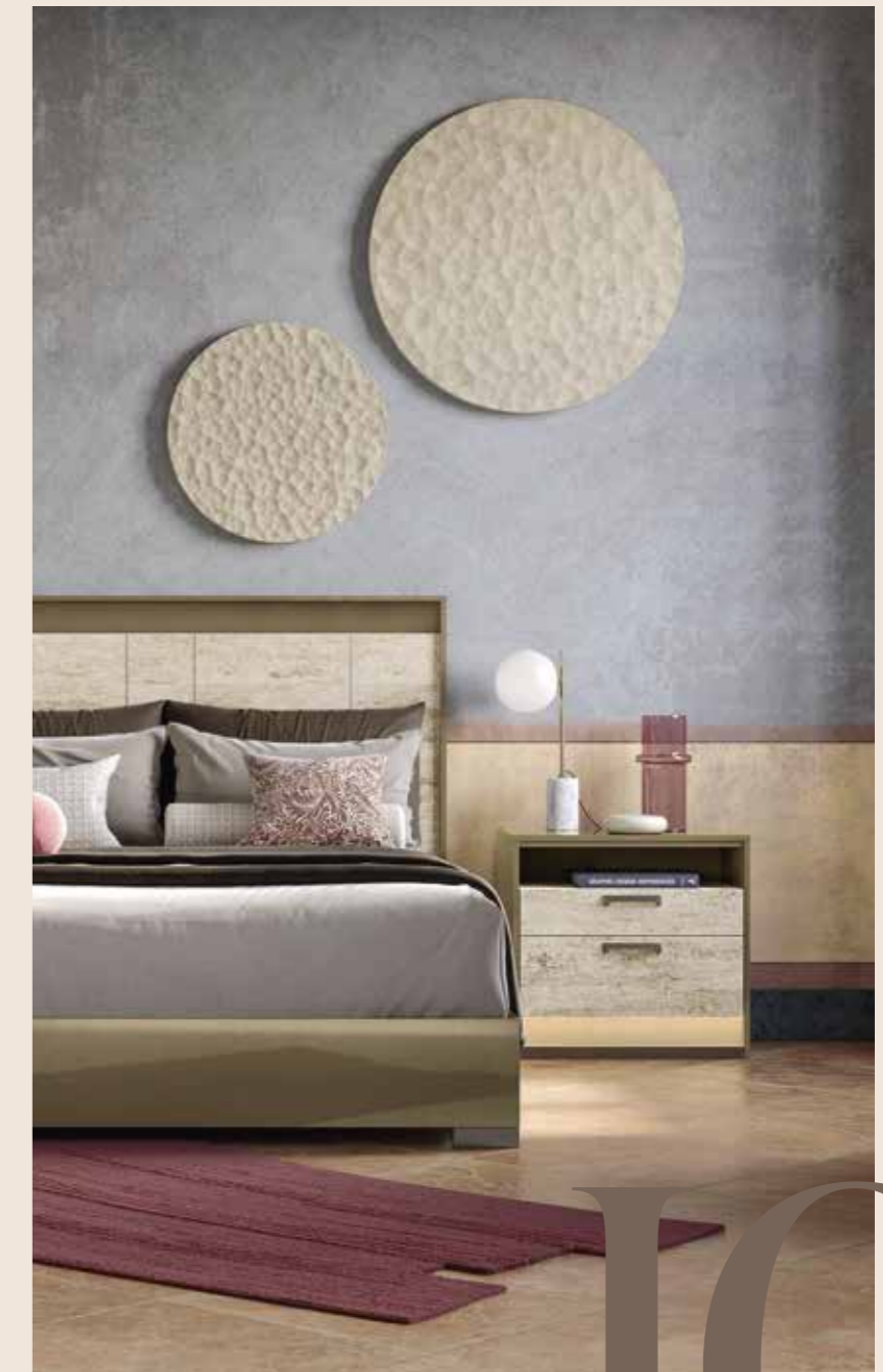
Jo bedroom set, roman interior

В спальне Jo's тактильное богатство травертина дополняется драгоценной эссенцией золота. Симфония роскошных тонов сходится в элегантном дизайне, где гладкие плоские поверхности плавно сменяются освещенными нишами.